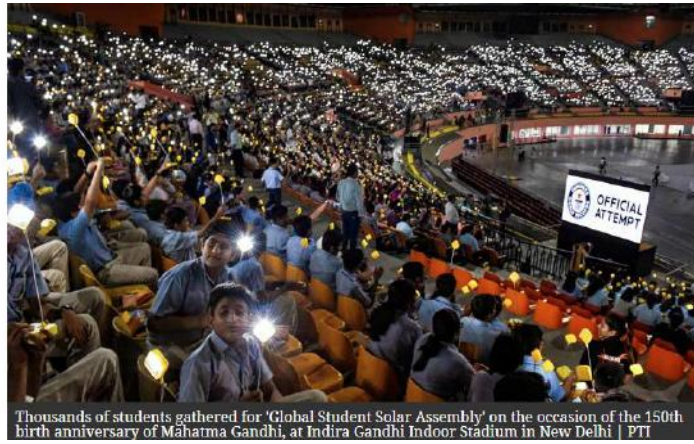
Thousands of students gathered for 'Global Student Solar Assembly' on the occasion of the 150th birth anniversary of Mahatma Gandhi, at Indira Gandhi Indoor Stadium in New Delhi