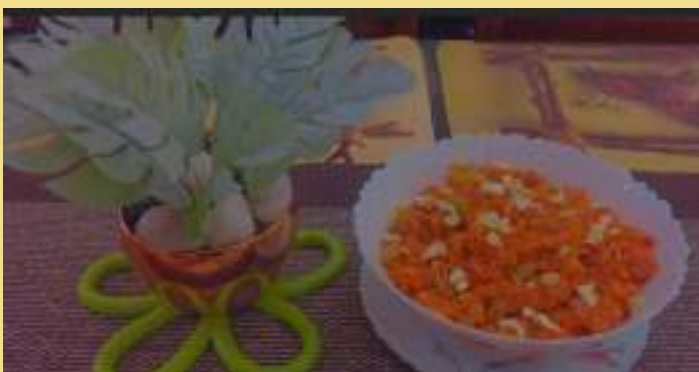
Shambaavi, X-E 3rd Position