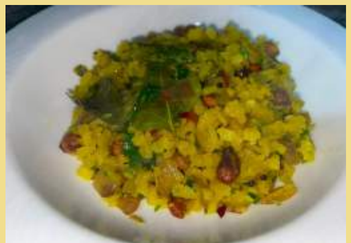
Sualeha Samshad, X-C 3rd Position