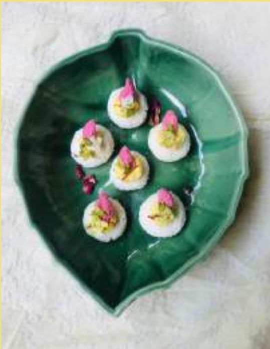
Kriti Jain, X-E 1st Position